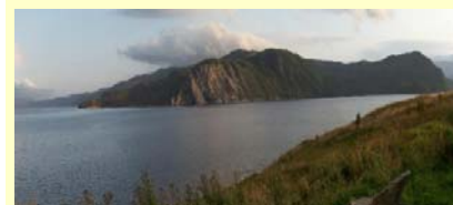
Norris Point, Gros Morne National Park